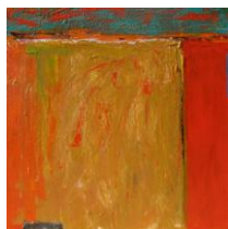
Jan Burns, 12"x12, Color/Texture Study, 12"x12", Acrylic, one part of a Triptych.

Color can be bold, bright, or intense. It can also be soft, delicate or subtle. It is often used in paintings to evoke emotions and moods. Imagine a carnival scene without color. Imagine a spring garden without color. It is not surprising that most artists feel color is an essential part of their creative process.