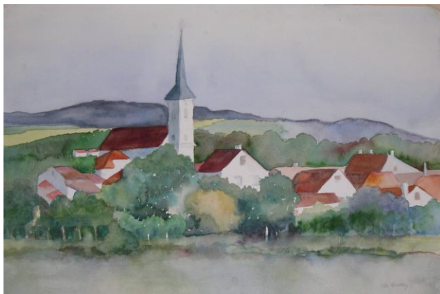
"Durnstein" by Rita Bentley