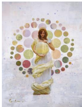
UNITY, VARIETY, HARMONY AND PATTERN, 36 X 48 INCHES, OIL ON LINEN ON PANEL